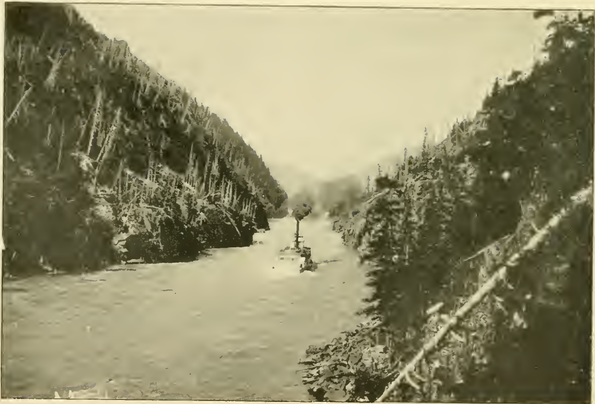
The Stickeen Canyon.